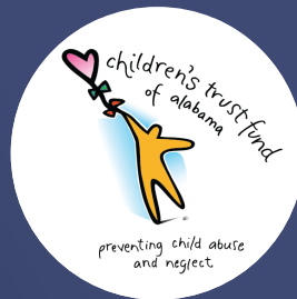
Children's Trust Fund Grant Recipient